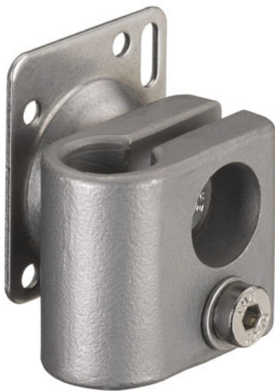
Part no.: 50120426 BTU 200M.5-D12 Mounting system